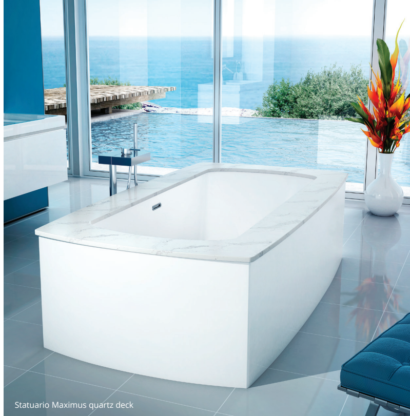
Statuario Maximus quartz deck